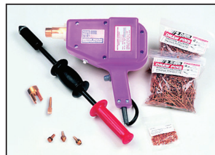
JO2000 - SUPER-PRO KIT