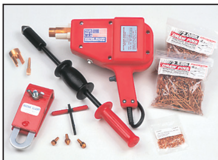
JO1550 - DELUXE KIT