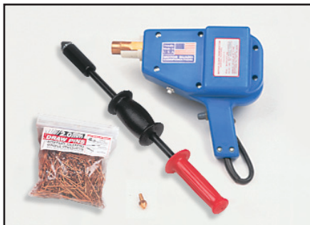
JO1050 - ENTRY-PLUS KIT