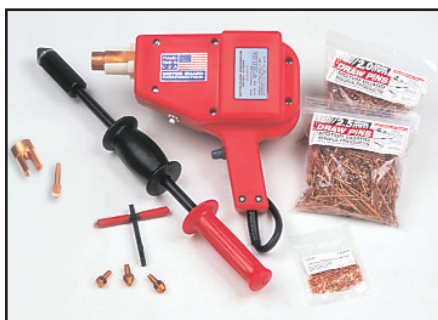
JO1525 - PRO-PLUS KIT