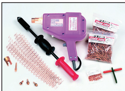
JO2250 - SUPER-PRO PLUS KIT