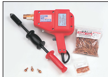
JO1500 - PROFESSIONAL KIT