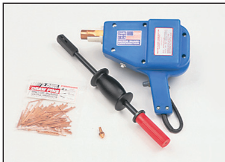
JO1000 - ENTRY KIT

The Magna-Spot® 1000, 1500 and 2000 Series products all incorporate our exclusive Low-Heat technology, designed for today's high-strength steel unibody vehicles. With plenty of power for any job, these welders virtually eliminate 'burn-through', a common problem associated with other models.